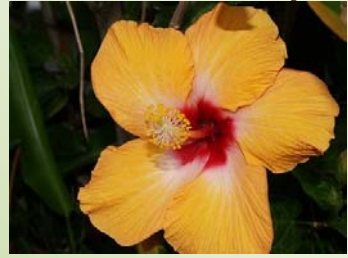
When it has removed the ugliness of life.