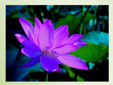
MĀSA Vol. 4, Issue 2, February 2011